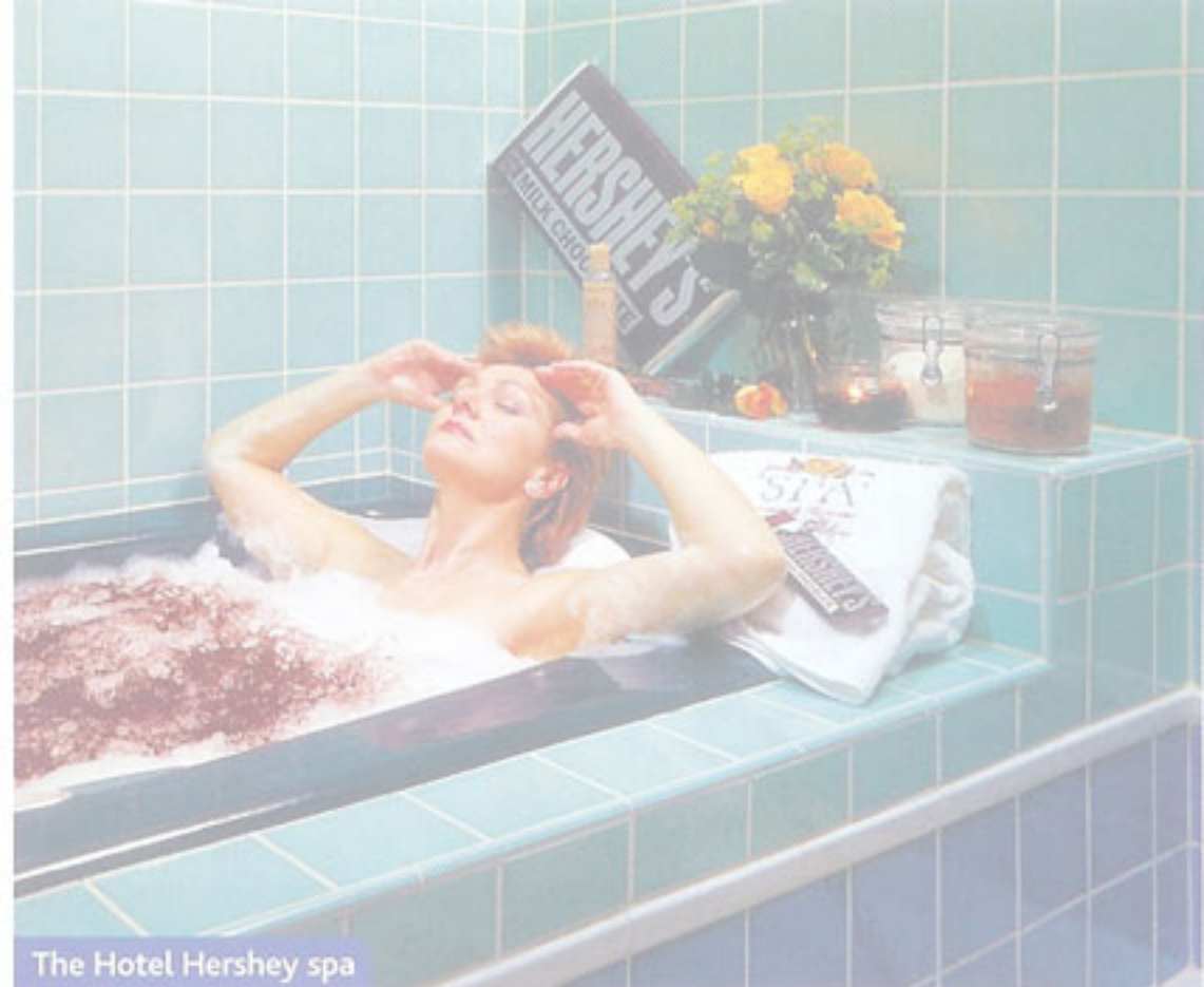
The Hotel Hershey spa